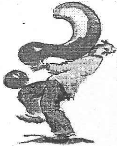
The Alpha Man carries the Questions of Life

During the period, the people of St John's continued to donate food and second hand clothing to City Mission – just a small steady flow – but it all helps. Some of our people are actively involved in the running of City Mission too.